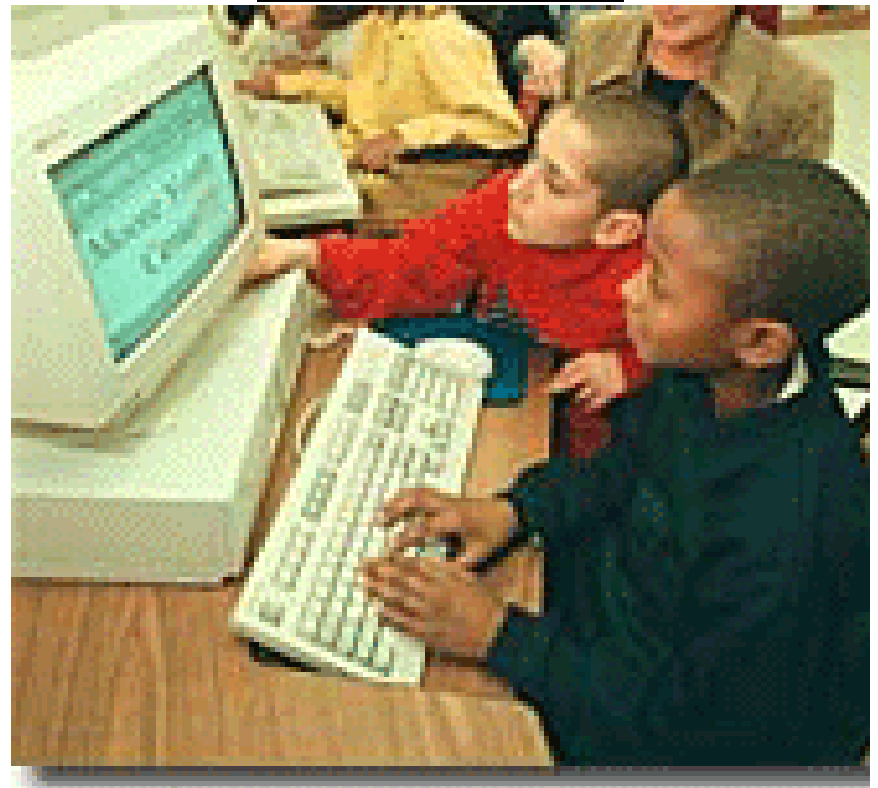
<u>Pupils at the keyboard</u>

The teacher addresses the whole class and uses the interactive whiteboard and laptop computer to demonstrate what he expects each computer group to do and thus sets up the task that is to be completed.